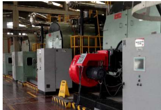
Brewery factory - Colombia