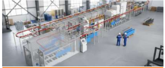
Coating, Painting & Furnaces