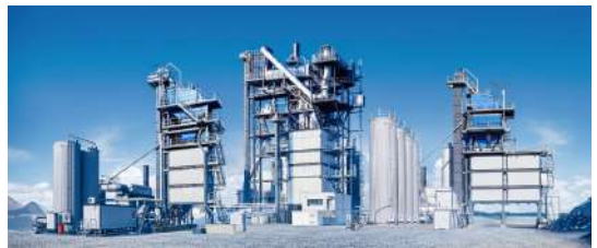
Asphalt, Construction & Bitumen Heating