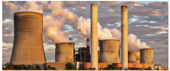
Incineration & Environmental Plants