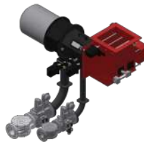
Separate Gas Trains & Servomotors