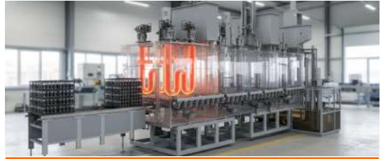
Industrial Process Plants