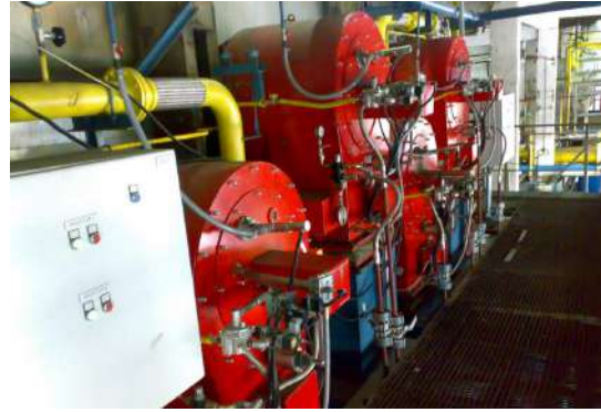
District Heating - Romania