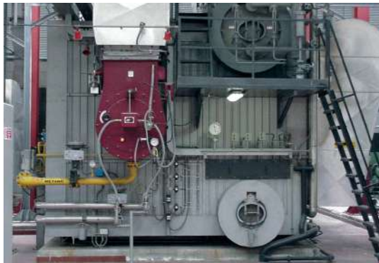
Building (Airport) - Italy