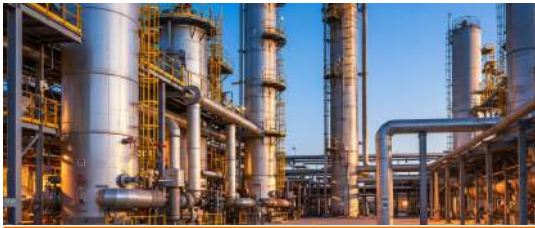
Energy & Power Plants