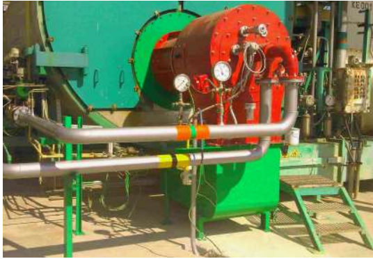
Steam Boiler - Italy

These selected case studies show how burner and combustion control solutions from General Bruciatori and ETC, aligned with the technical scope offered by InnoBurn, have been applied in real industrial projects across different industries and operating duties worldwide.