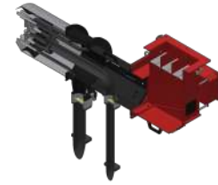
Multi-Fuel Heads with common air control