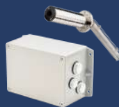
ETC O2 trim systems