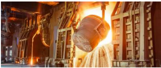
Ceramics, Glass & High-Temperature Furnaces