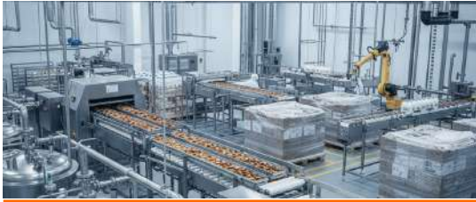
Food Processing & Packaging