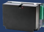
ETC 6003 - ETC 6009