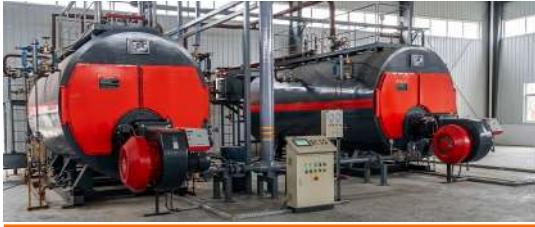
Boilers & District Heating Systems

InnoBurn combustion solutions support a wide range of heating, process, energy, environmental, and high-temperature industrial applications.